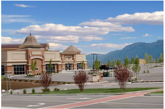
Commercial/Retail building pad