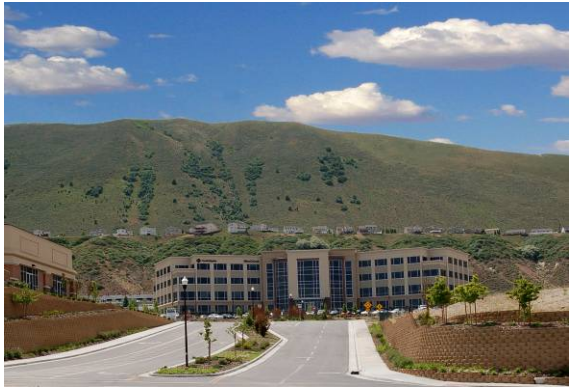
View looking up Corporate Drive