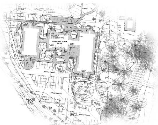
University of Utah Guest House